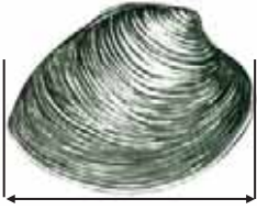
Hard Clam 1.5 inches