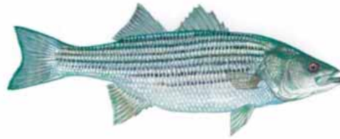
Striped Bass or Hybrid Striped Bass

1 fish at 28 inches to less than 43 inches