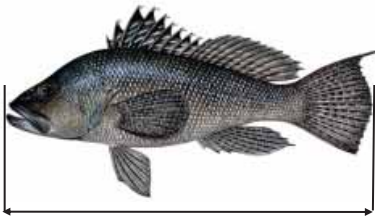
Black Sea Bass*