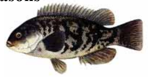
Tautog 15 inches