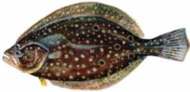
Summer Flounder (Fluke)

The 2017 Summer Flounder regulations are currently under review. See the Division's website at njfishandwildlife.com for the most up to date information.